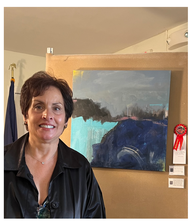
"Refreshing! Strong compositional elements. Expressive manner delivers strong emotional tone."