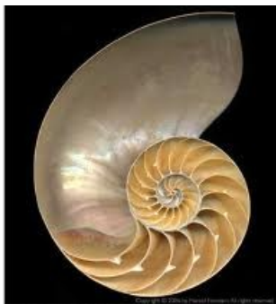
5-58 Nautilus Half Shell